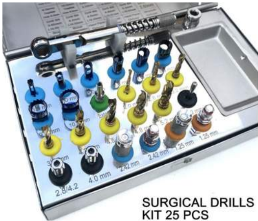
SURGICAL DRILLS KIT 25 PCS